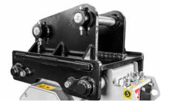
Customized attachment bracket