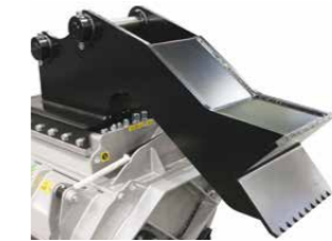
Customized attachment bracket with fixed thumb

DIFFERENT STYLE TO CUSTOMIZED ATTACHMENT